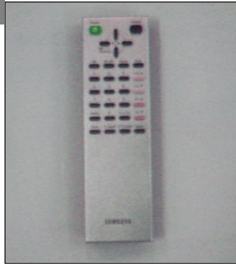
Old type remocon